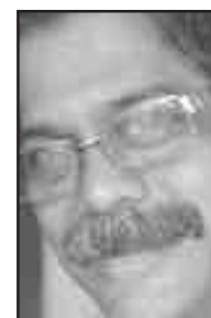
Mr. Milind A. Ketkar • Freelance Photographer

Many times, photography to record some objects, in various scientific studies in research laboratories and institutes is essential. It can be through microscope or using macro lens. Forensic photography is also a specialized branch.